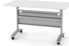
LEV-2448TBL-TU54 47.25w x 23.75d x 29h