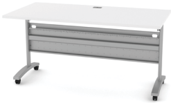
LEV-3060TBL-TU72 59.25w x 29.5d x 29h