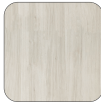
Winter Wood WW