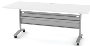
LEV-3072TBL-TU72 71w x 29.5d x 29h