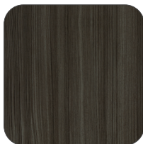
Grey Dusk GD