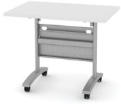
LEV-2436TBL-TU24 35.5w x 23.75d x 29h