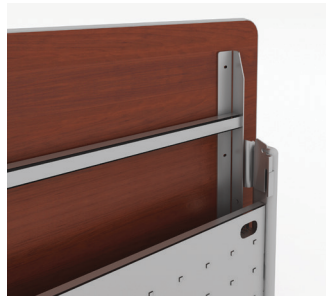
LEVER FLIP TOP