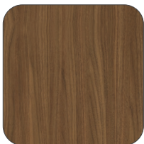
Black Walnut BW