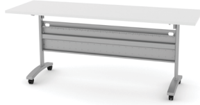
LEV-2472TBL-TU72 71w x 23.75d x 29h