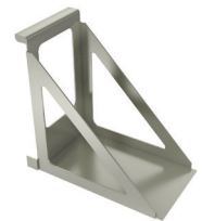
OPTIONAL CPU HOLDER