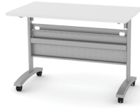
LEV-2442TBL-TU54 41.5w x 23.75d x 29h