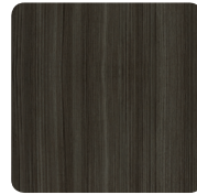
Grey Dusk GD (Show Below)