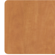
Sugar Maple SM