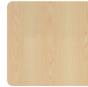
Hardrock Maple HM