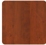
Autumn Maple AM