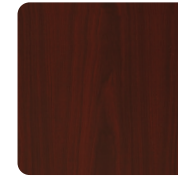
Royal Mahogany RM