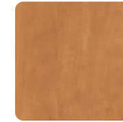
Sugar Maple SM