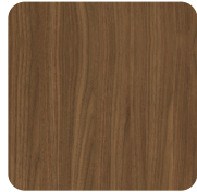
Black Walnut BW