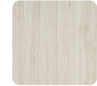
Winter Wood WW