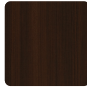
Evening Zen EZ