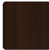
Evening Zen EZ