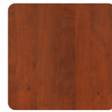
Autumn Maple AM (Shown Below)